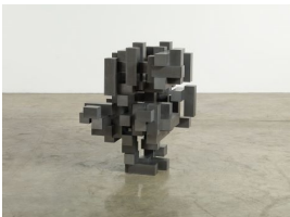
BIG FORM, 2015