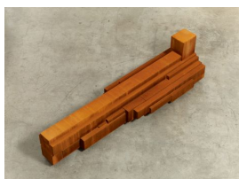
BOND II, 2015