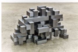
BIG HIDE, 2015