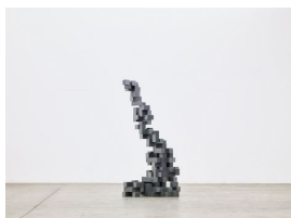
BIG SKEW, 2015