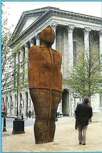
Above: Antony Gormley, 'Iron Man' 1992/93.

Winner of the 1994 Turner Prize and creator of Birmingham's Iron Man , Antony Gormley is renowned for his distinctive representations of the human form.