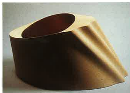
Martin Smith White Noise II 2000 © The artist