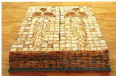
Antony Gormley Bed 1981