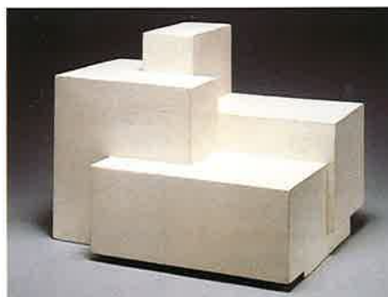
Ben Nicholson Circa 1936 (sculpture)

Artists on Artists enables works from the Tate Collection to be shown in innovative ways, allowing artists to choose works they find interesting or inspirational. In this context, Antony Gormley has selected a particular group of works by Barbara Hepworth, Ben Nicholson and Naum Gabo.