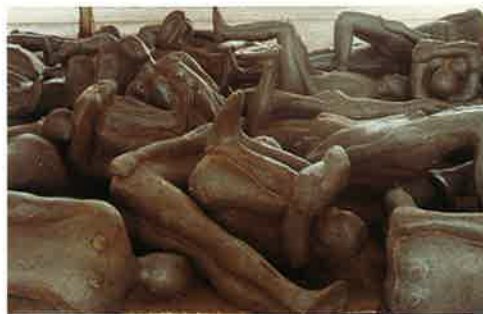
Antony Gormley Critical Mass 1995

This sculpture explores a range of ideas about the physical and metaphysical self, and the body in relation to history and place. Critical Mass (1995) is a group of over sixty life-size figures, cast in iron from the artist's own body. The installation in the circular gallery is dramatic and architectonic.