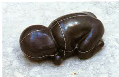
Antony Gormley Still IV 1994 Private collection © The artist

PLEASE PLACE ADVANCE ORDERS BY CALLING 01736 791103