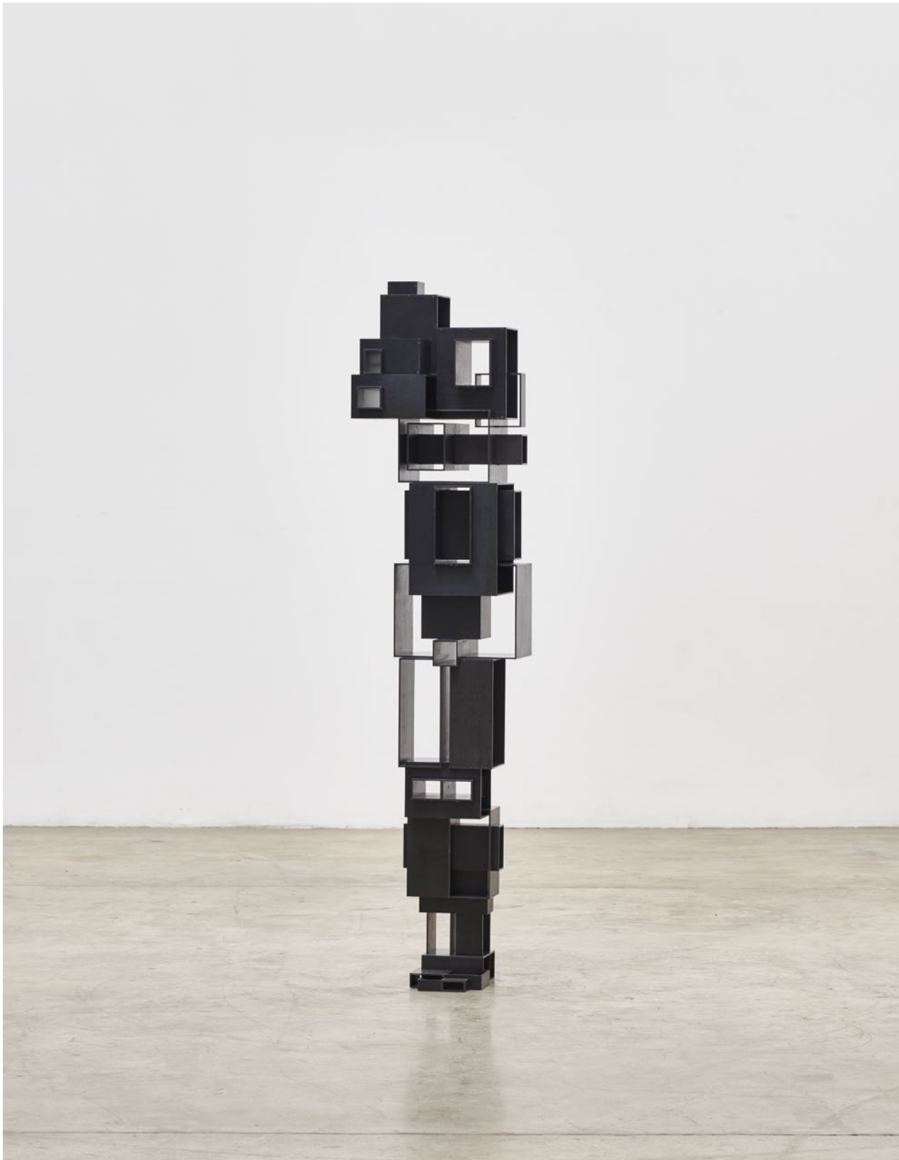
Antony Gormley, OPEN HOME, 2014