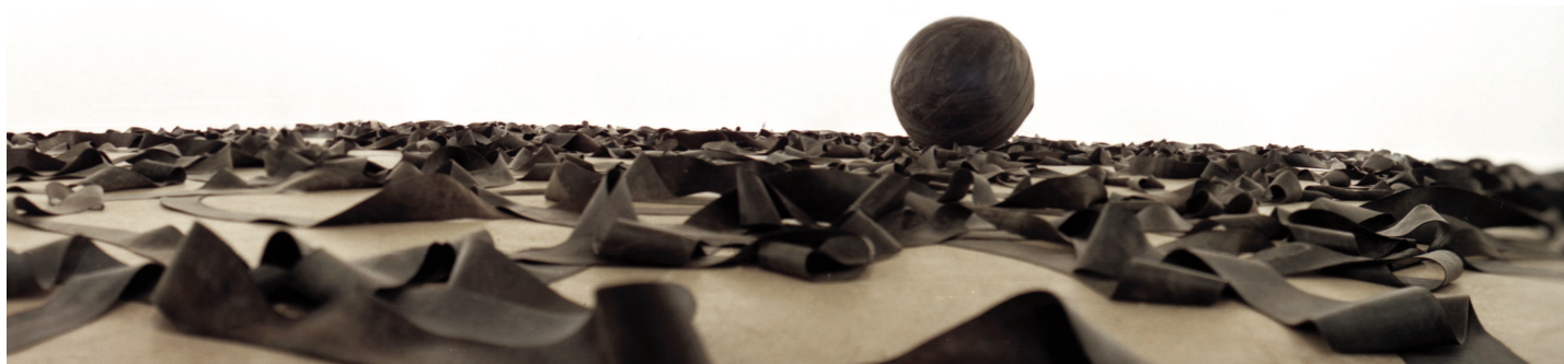
1- GROW